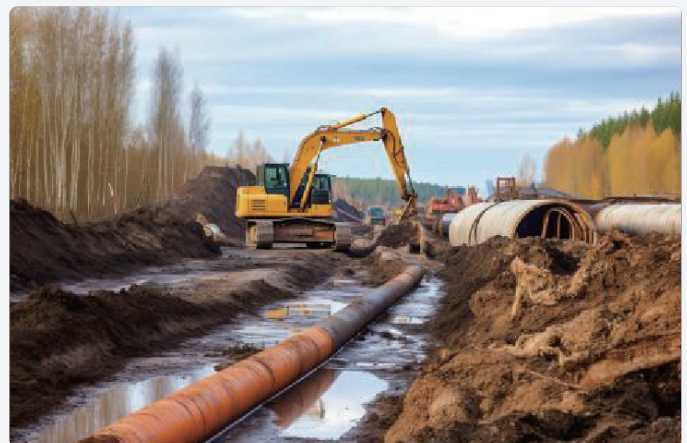
Engineering Survey and Design