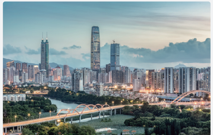
City-Scale 3D Reality Modeling