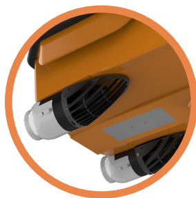
Reinforced Aluminum Alloy Cover